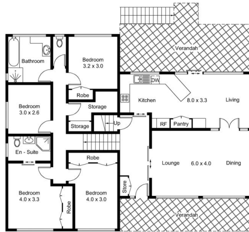
First Floor = 139.7 Sq M